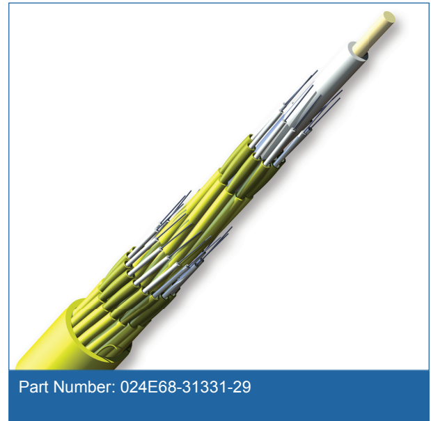
Part Number: 024E68-31331-29

UL-1666 (for riser and general building applications)